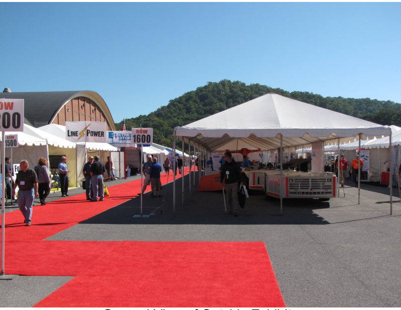
General View of Outside Exhibits