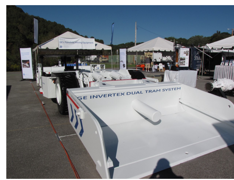
Part of GE Fairchild Exhibit